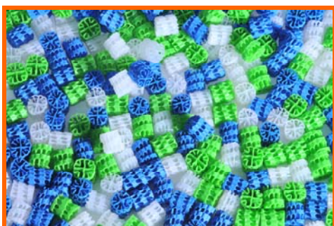
Figure 1 Picture carrier material

The MBBR system consists of an activated sludge aeration system where the sludge is collected on recycled plastic carriers. These carriers have an internal large surface for optimal contact water, air and bacteria. See elements underneath.