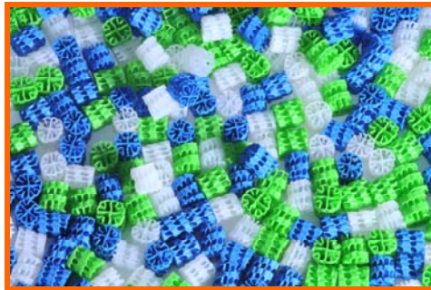
Figure 1 Picture carrier material

The MBBR system consists of an activated sludge aeration system where the sludge is collected on recycled plastic carriers. These carriers have an internal large surface for optimal contact water, air and bacteria. See elements underneath.