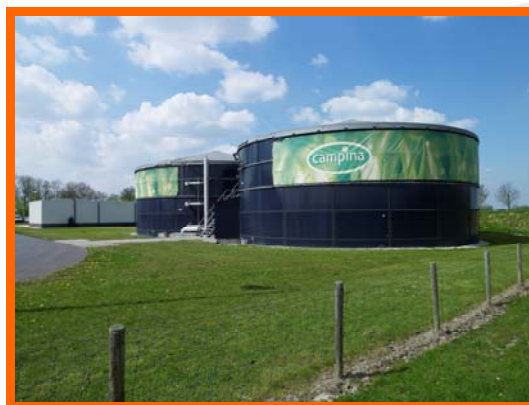
Bioreactor and buffertank FrieslandCampina Maasdam